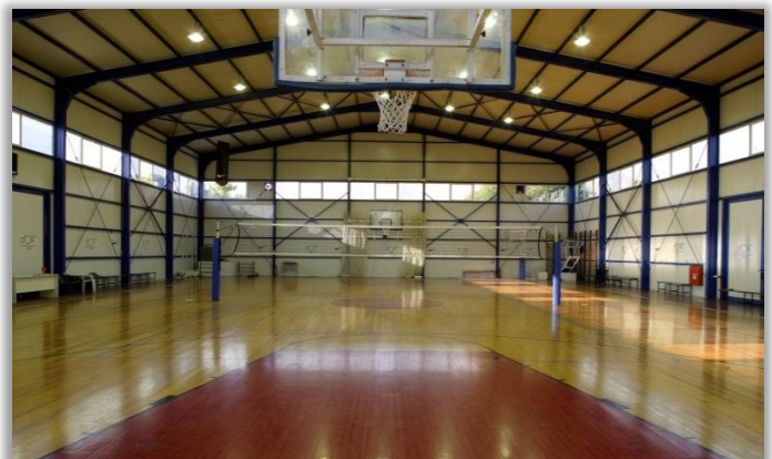
SPORTCAMP Indoor Hall