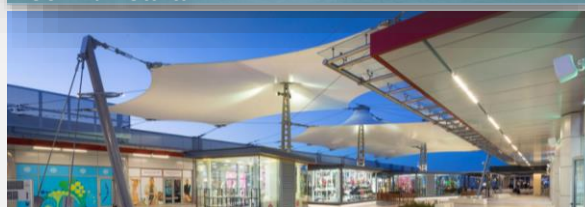
Mare West Mall Center