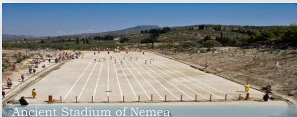
Ancient Stadium of Nemea