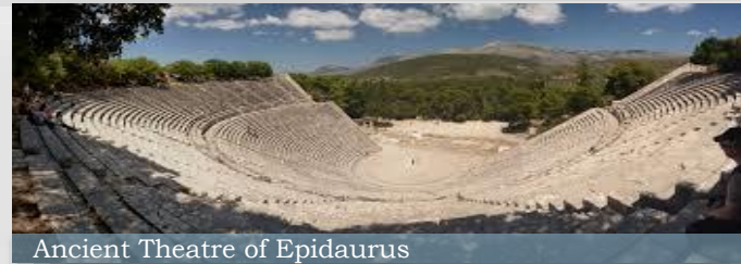
Ancient Theatre of Epidaurus