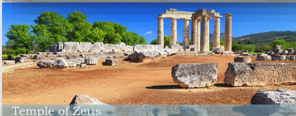
Temple of Zeus