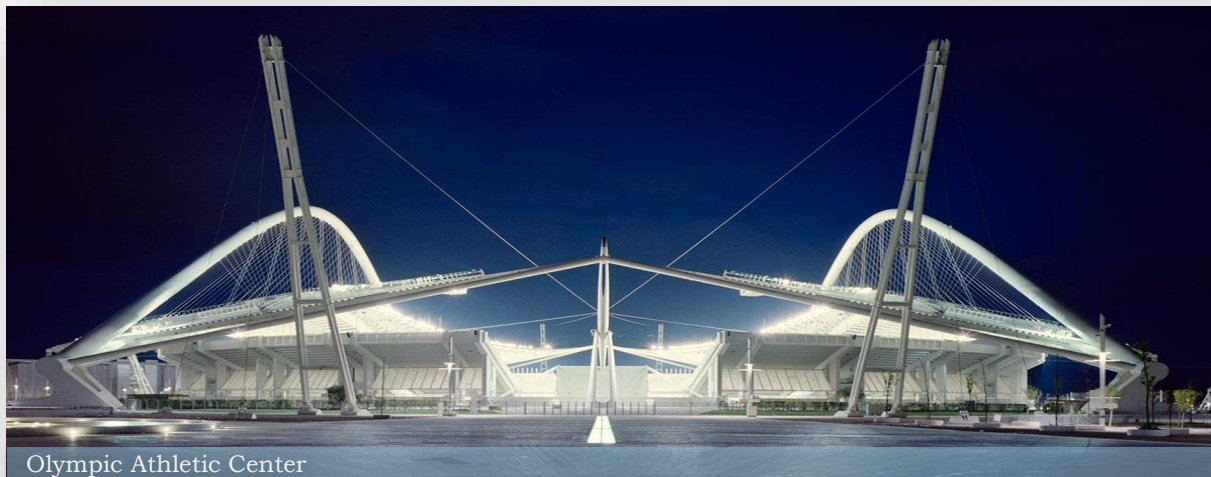
Olympic Athletic Center