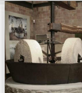
Markellos Olive Heritage